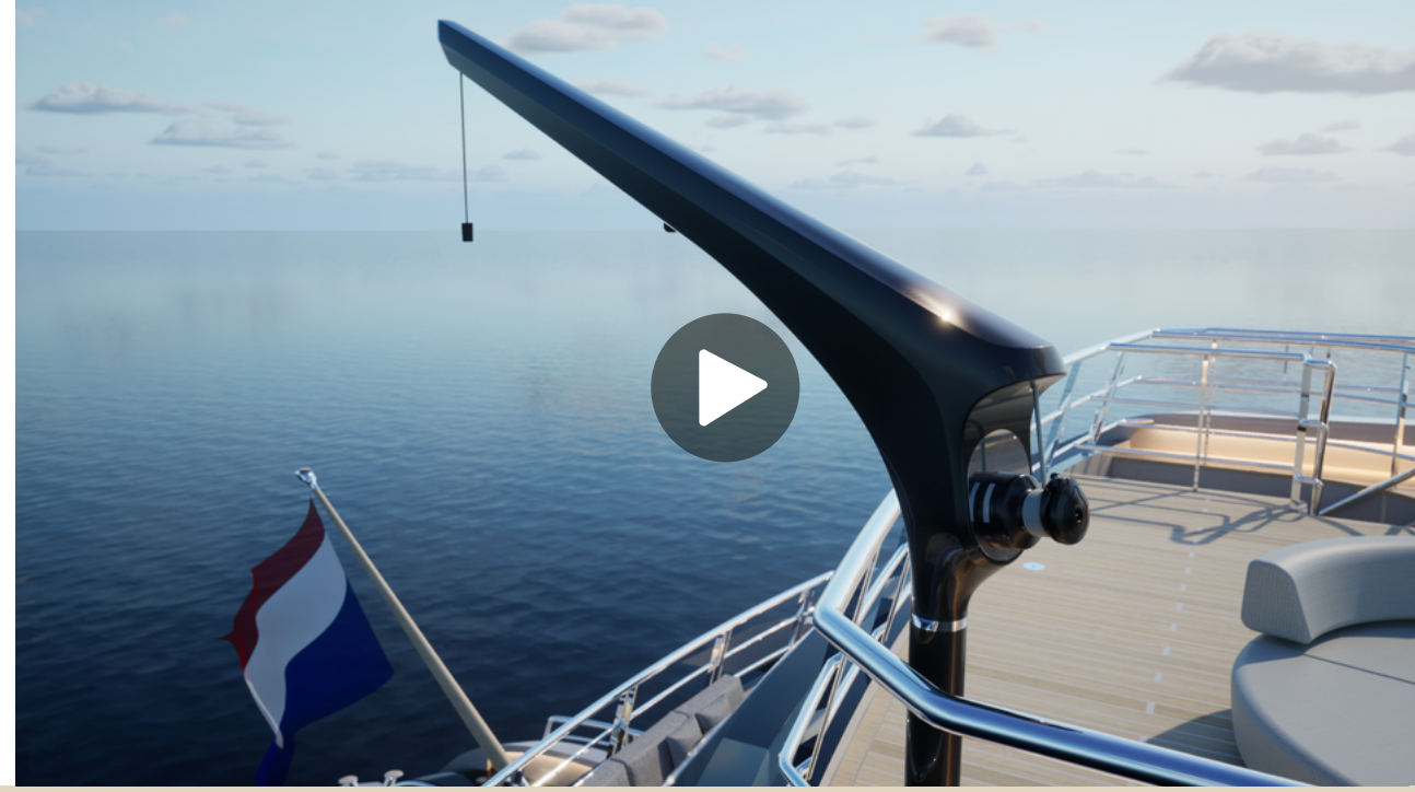
Click to watch video

Feel free to message or call us anytime if you have questions.